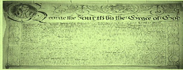
Charter granted by King George IV in 1827, establishing King's College, Toronto, now the University of Toronto

Among the past and present groups formed by royal charter are the Company of Merchants of the Staple of England (13th Century), the British East India Company (1600), the Hudson's Bay Company, Standard Chartered, the Peninsular and Oriental Steam Navigation Company (P&O), the British South Africa Company, and some of the former British colonies on the North American mainland, City livery companies, the Bank of England and the British Broadcasting Corporation (BBC). [2]